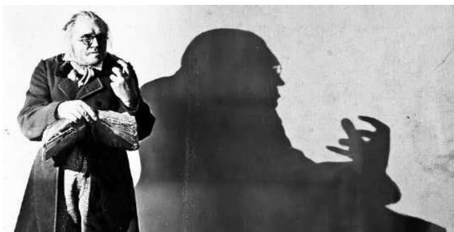
he Cabinet of Dr. Caligari (1920). Directed by Robert Wiene

German Expressionism in film is associated with high contrasts of darks and lights to convey nightmarish sets, often using the chiaroscuro lighting technique . Let's look at some of the classic examples that cemented this aesthetic steeped in shadows.